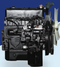
4SP 62 PS